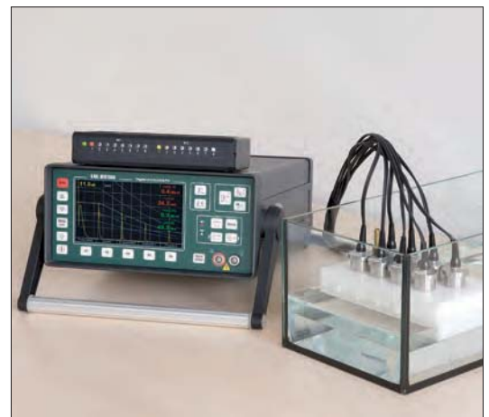
ECHOGRAPH 1094 with Port Control and 8 test channels