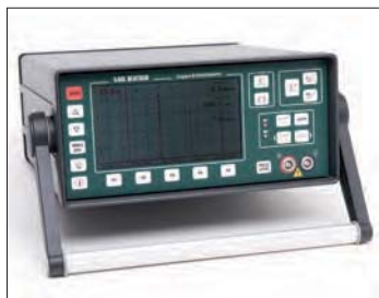
The ECHOGRAPH 1094