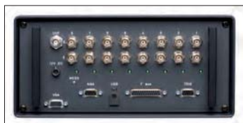
Rear panel with interfaces

The flexible ultrasonic flaw detector ECHOGRAPH 1094 is a testing electronic for stationary and mobile testing. The device is based on the technique of the well-proven ECHOGRAPH 1090. In addition, the multiplex technique allows to control up to 8 test channels. During testing, all 8 A-scans are being displayed at the same time (overlay mode). The delay time of the transmitters and the adaptation of the amplifiers can be selected individually for each test channel or probe. While working in single-channel mode, the device provides evaluation of the flaws based on the DGS and DAC technique.