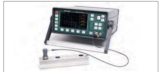
ECHOGRAPH 1094 (single channel)