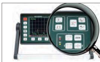
Direct keys for quick settings of important parameters

Optionally, an indication unit with an LED array can also be connected to the device. Thus, the flaw detection of the individual test channels can be clearly seen from a larger distance and under poor lighting conditions.