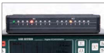
Port Control unit

The multiplexer provides the possibility to connect one to eight probes to the ECHOGRAPH 1094. The flaw indication on the two monitor gates is shown individually for each test channel in the bottom area of the screen.