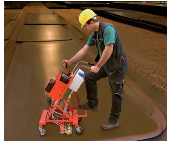
Ultrasonic testing on sheet metal by trolley (8 test channels)