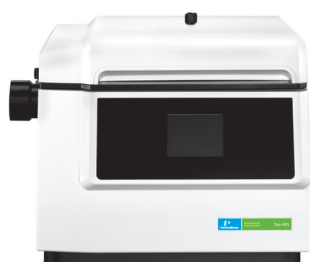
Titan MPS Microwave Sample Preparation System

IT'S NOT JUST THE MICROWAVE IT'S EVERYTHING BEHIND IT