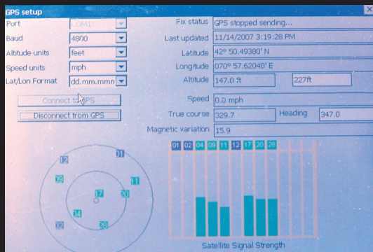
GPS satellite data