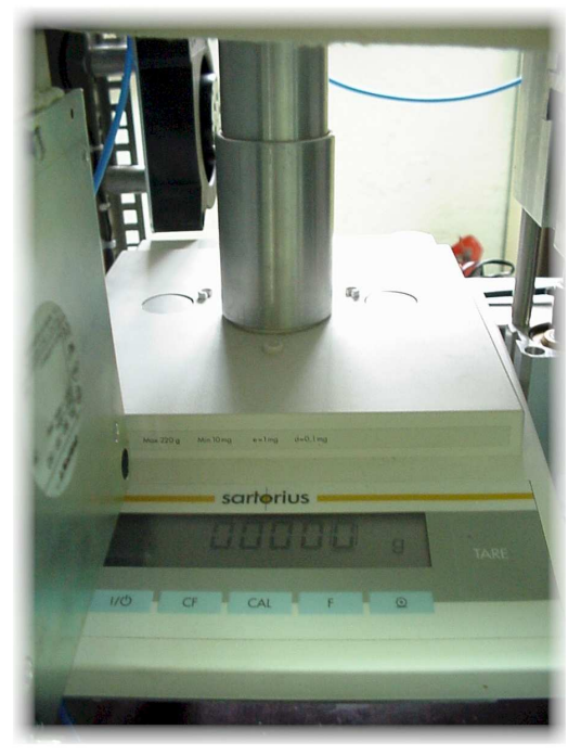
Metal parts instead of ceramics

The carousel is made of a stainless steel alloy for high temperature.