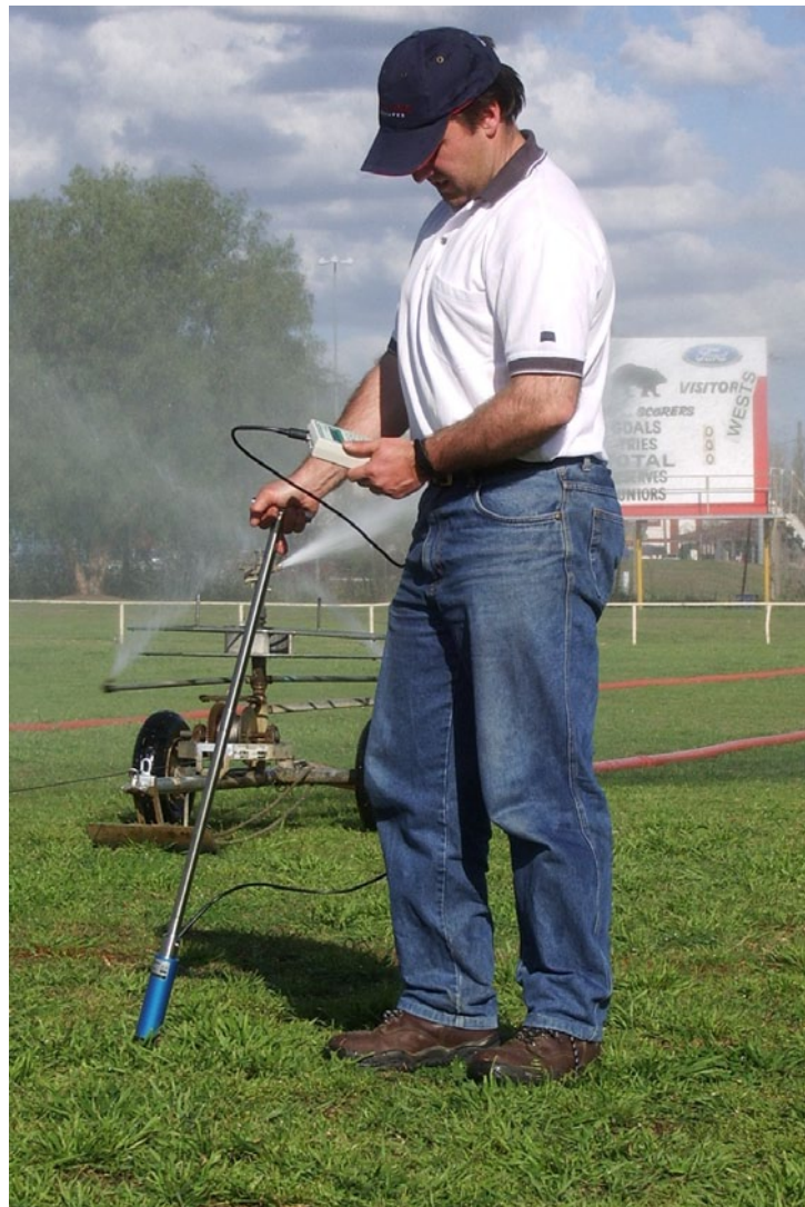
The MPKit measuring surface volumetric moisture content

MPExt Rod consists of a pair of chrome extension rods. Each rod is 35 cm long enabling measurement of soil moisture to 70 cm depth in the soil profile. One rod connects to the MP406 and the other has a "T" handle. Additional 35cm extension rods are available upon request.