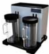
DI-110-A, KjelROC Scrubber