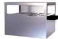
DI-010-A, Rack 10 DI-020-A, Rack 20