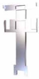
DI-050-A, Manual lift to mount on Digester Auto, for both Tube Rack and Exhaust

The KjelROC Digestion portfolio offers something for most labs